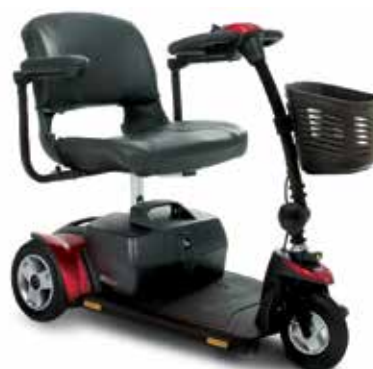
Go-Go Elite Traveller® Plus 3-wheel

PRIDE® MOBILITY SCOOTERS LIVE YOUR BEST®