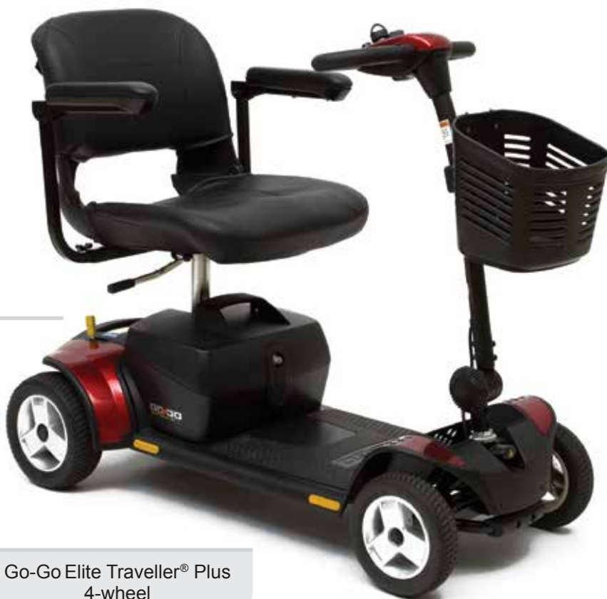
Go-Go Elite Traveller® Plus 4-wheel